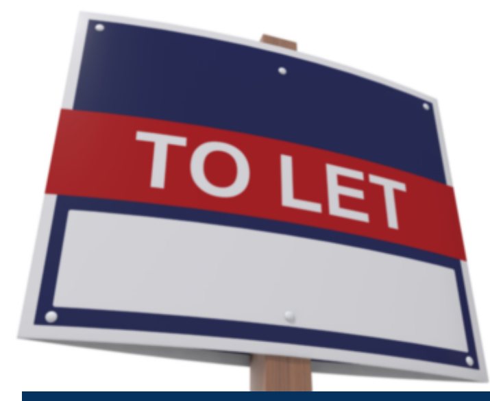
If you're a Buy to Let landlord or you'd like help investing in your first Buy to Let property please get in touch.

HM Revenue and Customs practice and the law relating to taxation are complex and subject to individual circumstances and changes which cannot be foreseen.